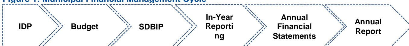
Figure 1: Municipal Financial Management Cycle

In an ongoing effort to improve the financial reporting system, the National Treasury, since 2014, has embarked on the process of reclassifying and reforming the municipal financial system to achieve a uniform classification of municipal expenditure data. Contained in the Municipal Regulations on Standard Chart of Accounts (2014), the regulations provide for a national standard for the uniform recording and classification of municipal budget and financial information by prescribing a standard chart of accounts for municipalities and their entities. Although the implementation of these regulations will not improve historic data, it is envisaged that it will enhance the alignment of budget and financial reporting formats across municipalities. Before the reforms, each municipality was reporting on its financials according to its own organisational structure and unique chart of accounts, which often resulted in disjuncture across municipalities on how revenue and expenditure are reported on (National Treasury, 2014).